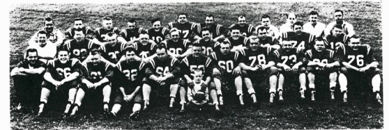
YOUR 1960 SHEBOYGAN REDWINGS